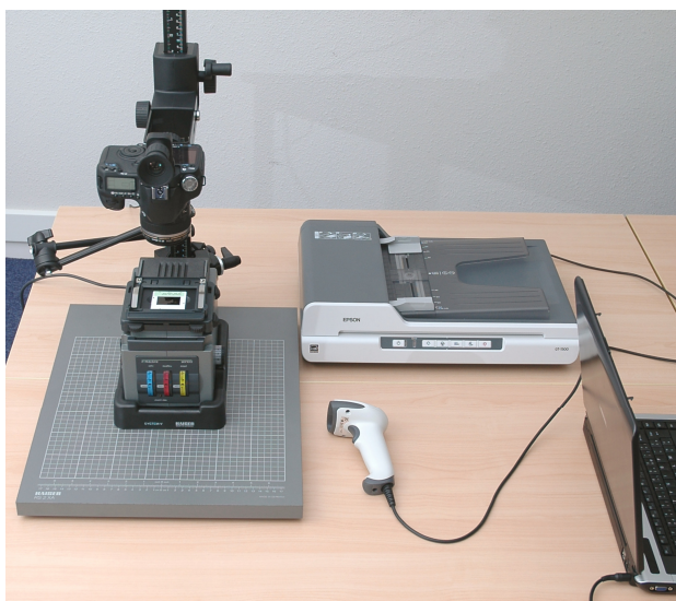
Digitization System showing copy stand, slide holder, barcode reader, scanner and computer system.

The Slide Digitization System provides the tools necessary to convert 35mm slides of single and stereo fundus images into a digital database of high-resolution images and related text information. This semi-automatic system captures fundus images using a copy stand and a slide illumination system, a high-resolution digital still camera to capture the film, a webcam to capture the whole slide including its frame, a Windows® computer, and two software products. An optional scanner and barcode scanner are also available to enter more specific data in the database.